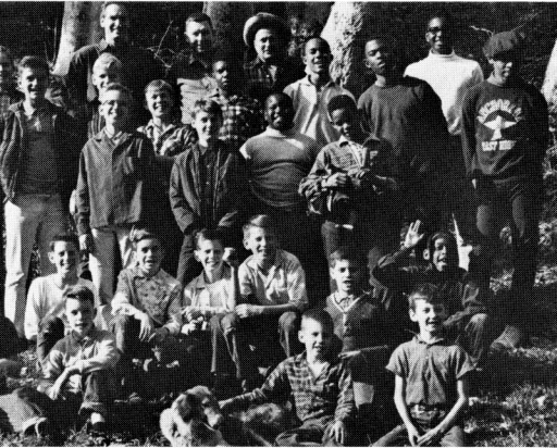
ALL SMILES—Recent outing produced these big smiles by Los Angeles Boys' Club members.