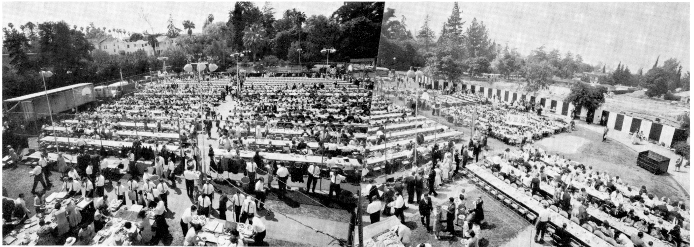
PANORAMIC VIEW—This composite of two photos gives you a revealing look at 3,000 headquarters area brethren feasting on the Ambassador College tennis courts, during recent holy days. Notice the large black

Brethren from San Diego to Bakersfield converged on the Civic Auditorium. There was "standing room" only at the Civic—as the many people had (Continued on page 3)