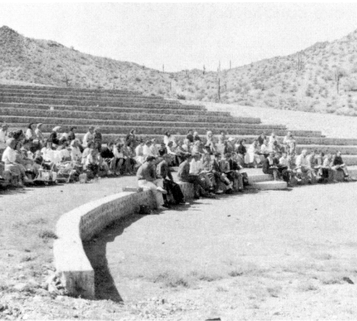
OUTDOOR SPOKESMEN —Phoenix men compete with wind and distance in unusual circumstances during recent club meeting.

While much of the nation shivered in rain, sleet, and snow, the Phoenix brethren basked (and burned) in the bright Arizona sun as the Phoenix Spokesman Club held its first outdoor meeting. Because of the adequate room and facilities, the entire Phoenix Church was invited to observe the meeting. A potluck lunch and picnic for everyone followed the conclusion of the Club session.